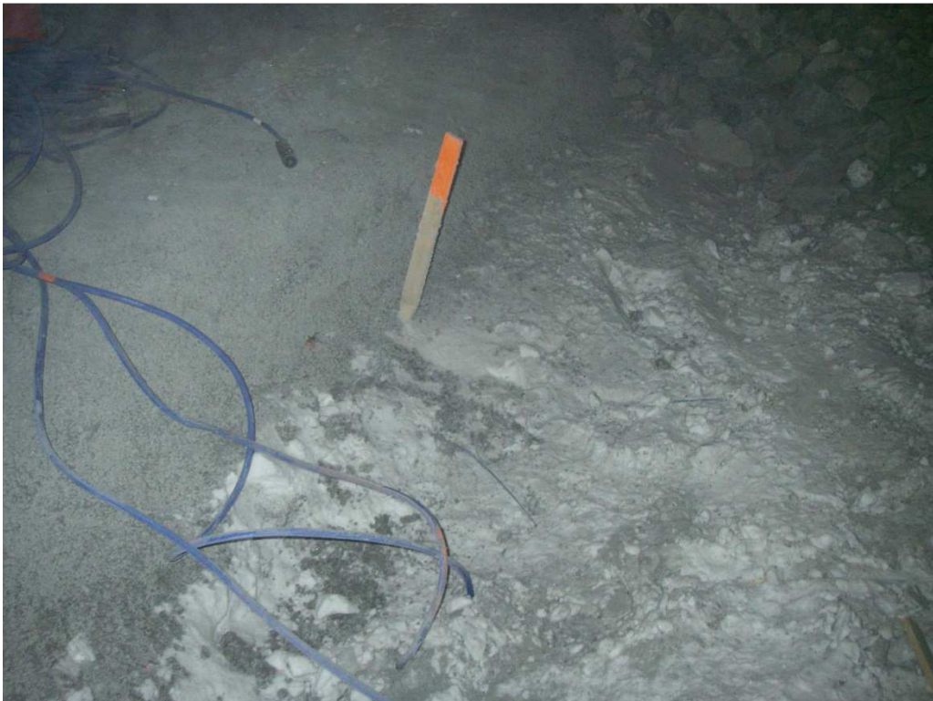
Photo 9: Snow piled up against the core around Sta. 0+60. This snow will have to be removed before transition material can be placed.