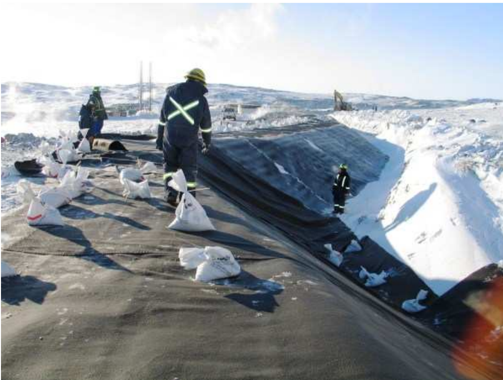
Photo 9: Placing geotextile. Note snow in keytrench that will be removed.